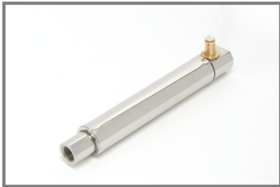
Shown with optional inlet & exhaust fittings